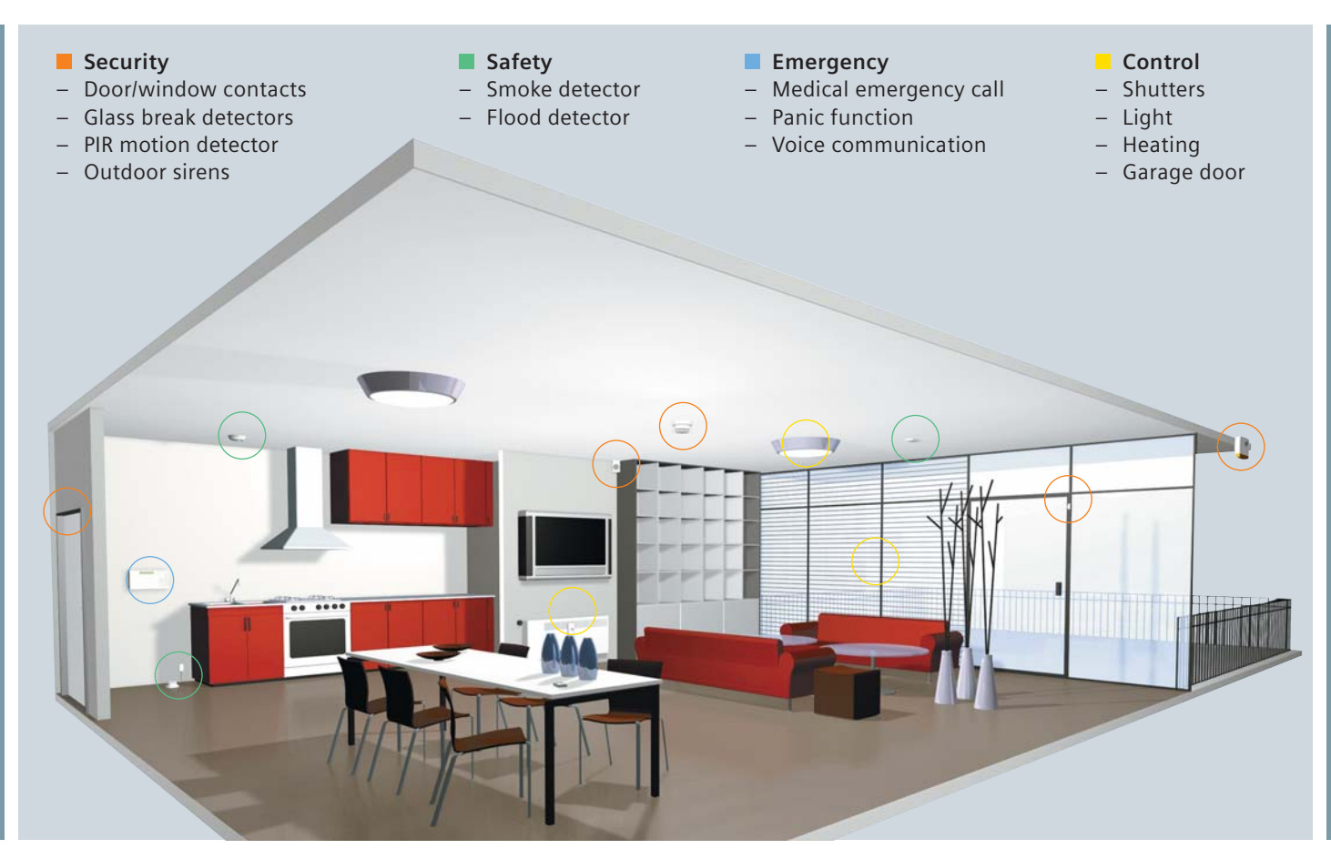
Take a home security virtual tour with Sintony 60 by visiting www.siemens.com/homesecurity